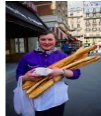
Threads B: consume loaves by taking them off the queue