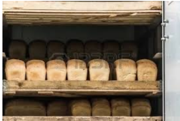
finite capacity (e.g. 20 loaves) implemented as a queue