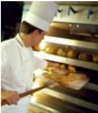
Threads A: produce loaves of bread and put them in the queue