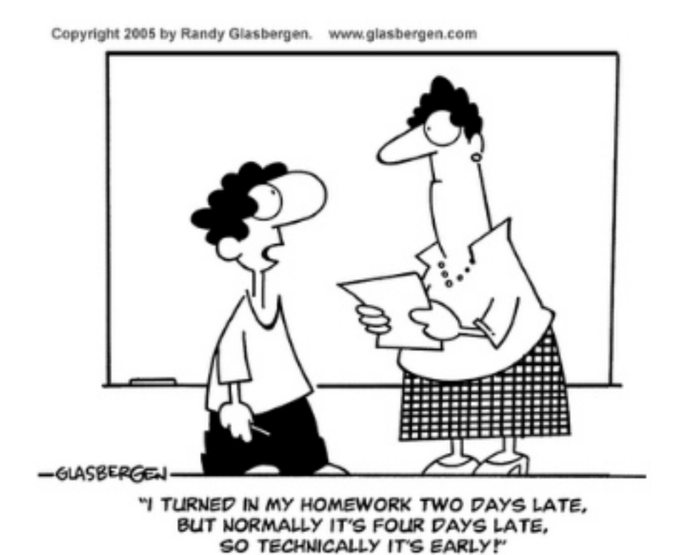
4 When you're done

Read the administrative handout posted on the course web page about class policies.